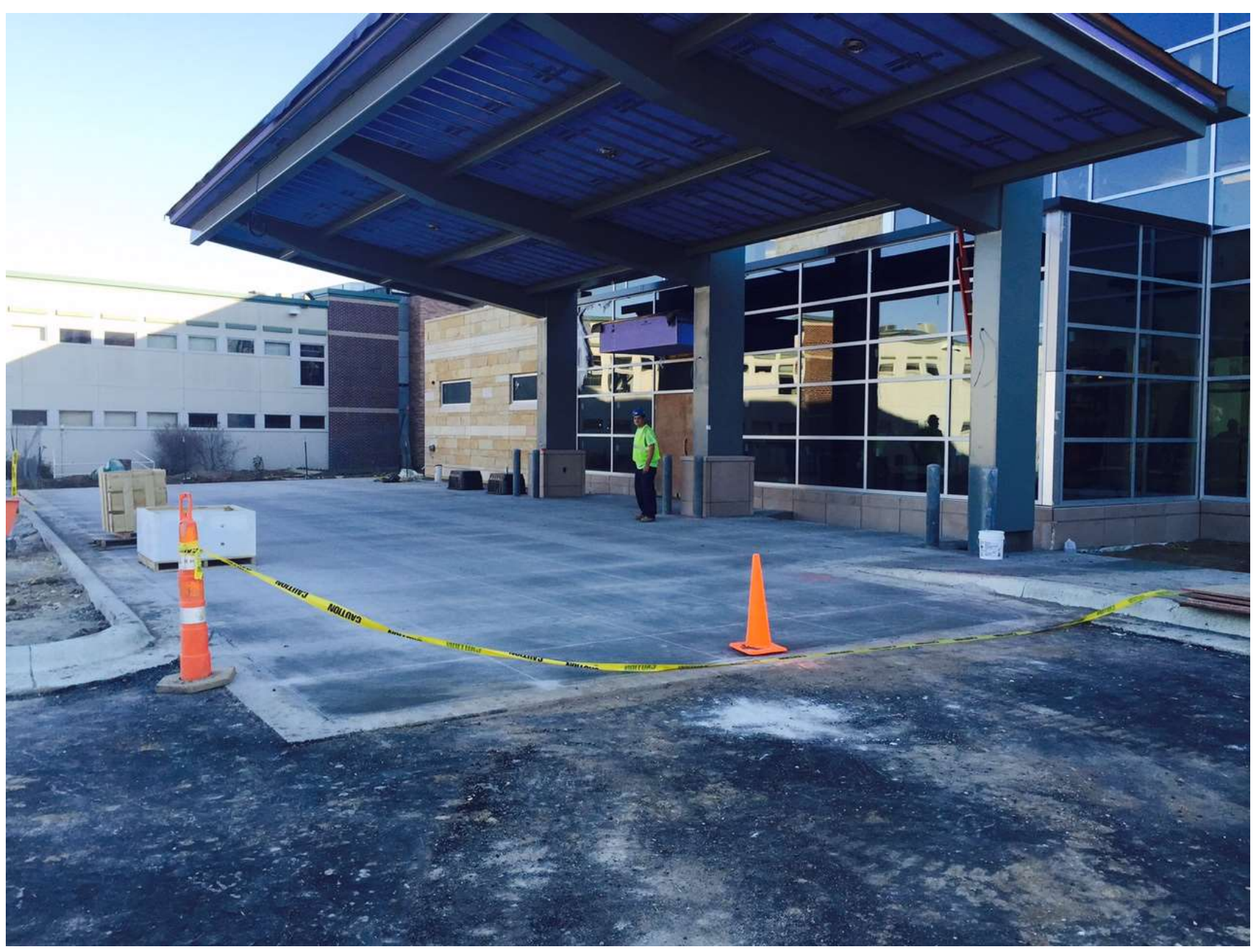
Entry Snowmelt apron poured.