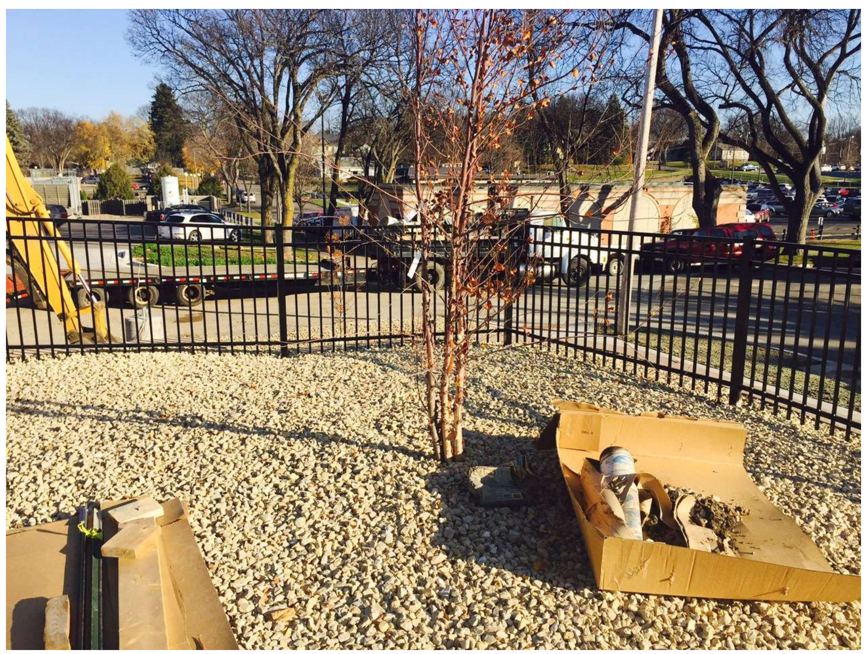
Landscaping and Railing on South side of Clinic.