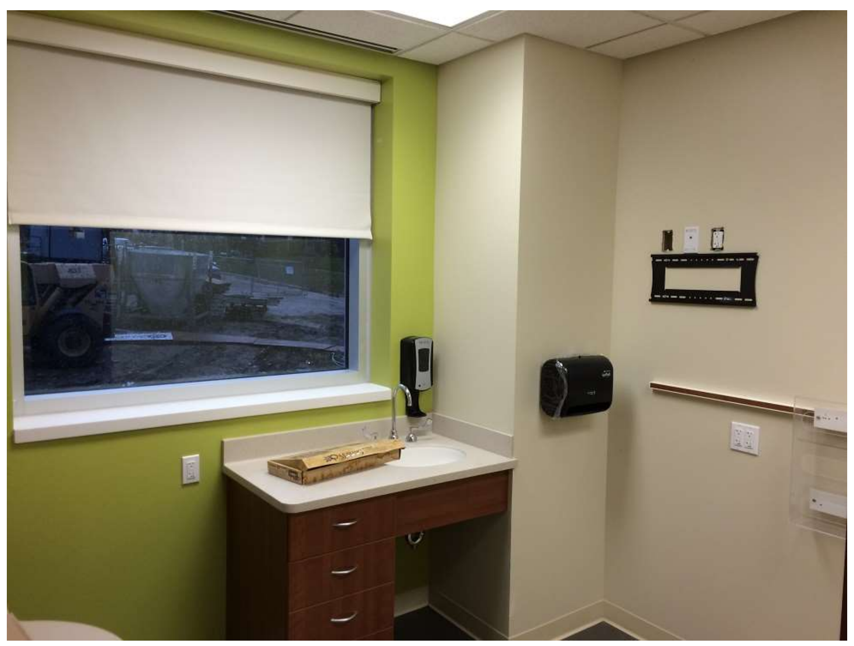
Wall mounted items and blinds installed second level.