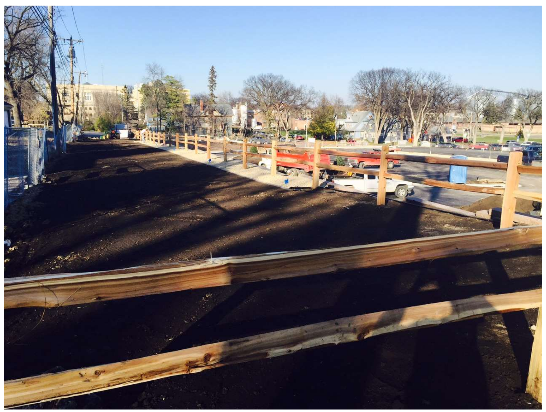
Fencing and Landscaping along North West Retaining wall.