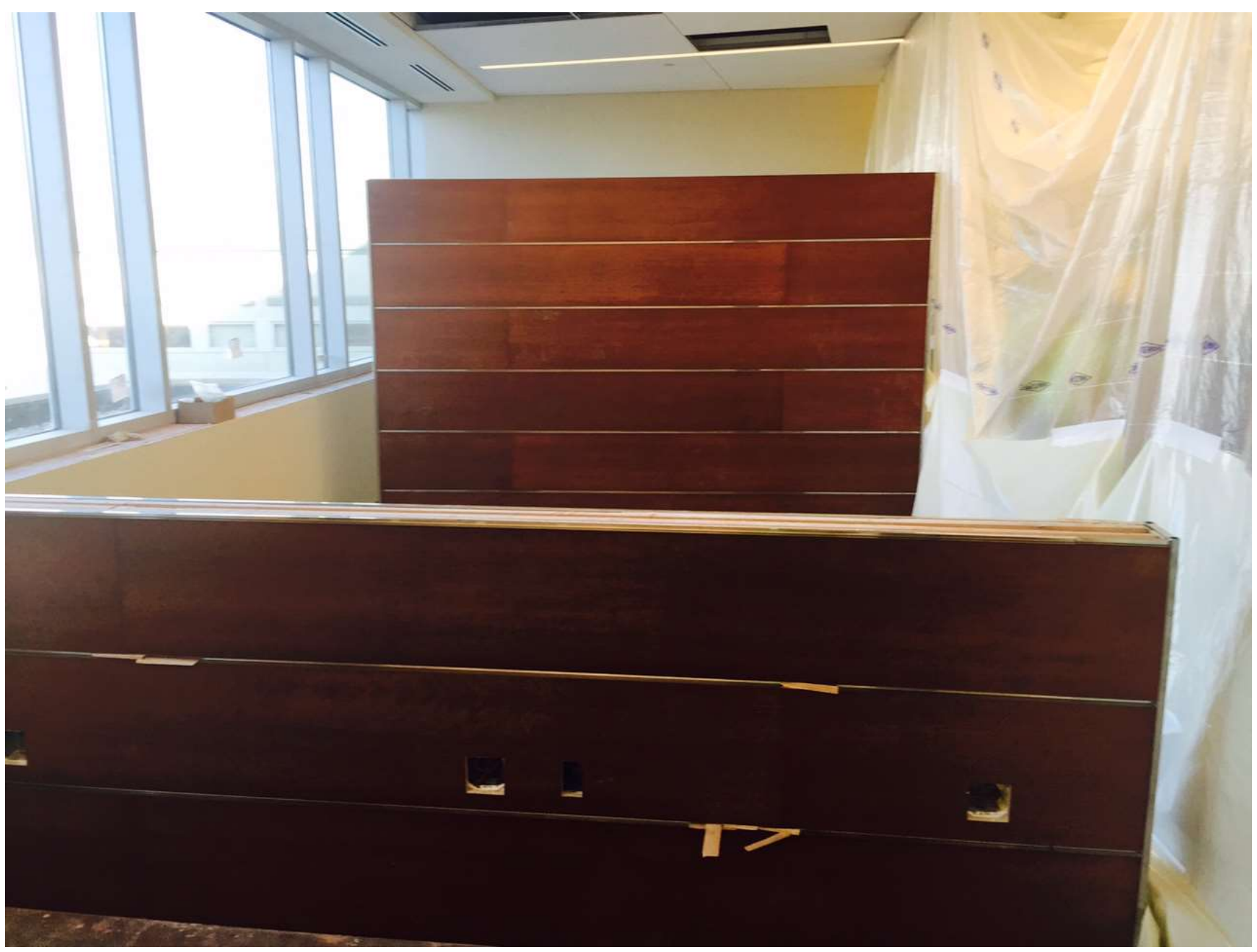
Interior Wood Paneling on Second floor.